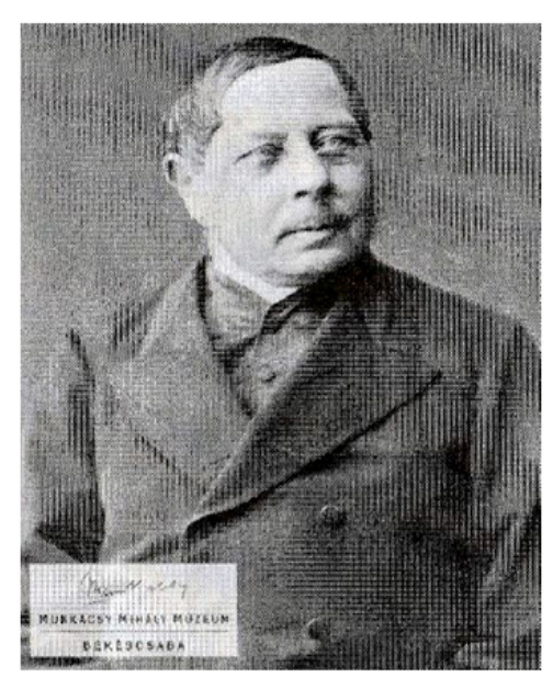
Portrait of Lajos Haan in 1880

The photographs are from the collection of the Mihály Munkácsy Museum in Békéscsaba; collector: Ján Kocsor; originally also published in the book Slovenský kňaz, maďarský historik ; however, the manuscript of the diary is kept in the Széchényi National Library in Budapest.